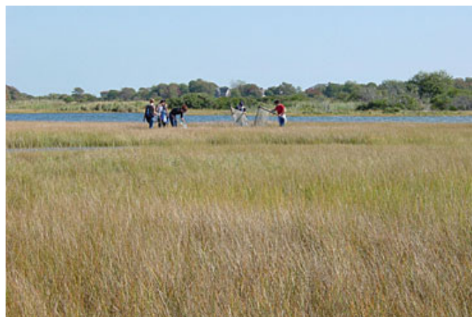
Restoration team at Drakes Island, Maine.

The bold assumption is that the constructed habitat will eventually perform the same functions and have a similar ecological value as a natural marsh. The new marsh is thought to follow a trajectory toward the characteristics of a marsh